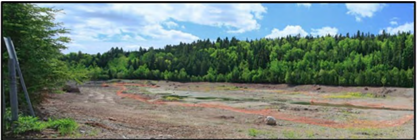
Matthews Cove Park (Wetland Restoration), Quispamsis, NB - Before Repair