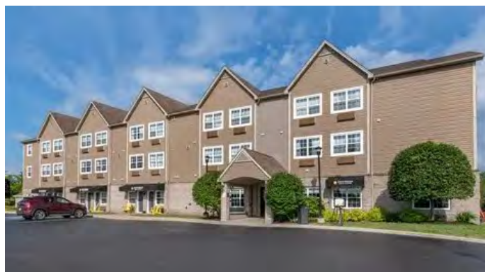
Booking Link Choice Hotels Reservations Group VN01H1

The room option is two queen beds (standard) at a rate of $165.00 + tax. Guests can call the hotel (506) 849-8050 or use the booking link to reserve rooms with a credit card.