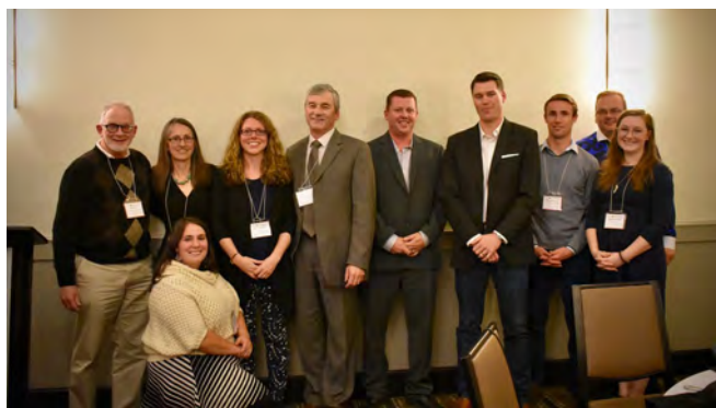
CLRA Atlantic Board Members - ARC2018, Miramichi, NB

We would like to invite you to our ANUAL GENERAL MEETING on, June 11th, at 5pm! This meeting will be hybrid with the in-person meeting taking place in Bedford, NS.