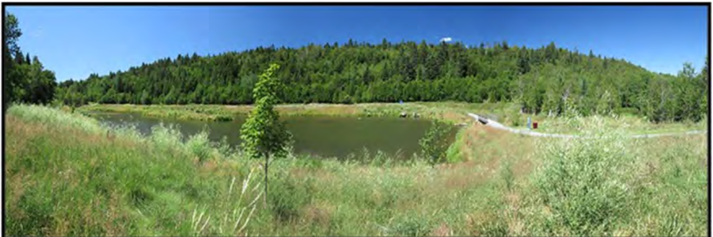
Matthews Cove Park (Wetland Restoration), Quispamsis, NB - Following Repair