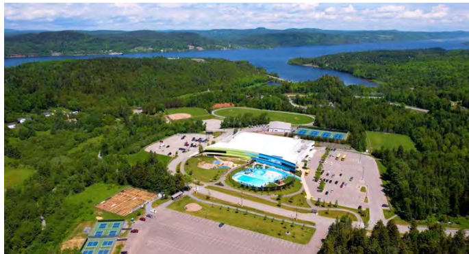
McCluskey Brothers Conference Centre | Town of Quispamsis

Refreshments and lunch are included on both Wednesday, Oct. 7 and Thursday, Oct. 8. Please advise of any food allergies during registration.