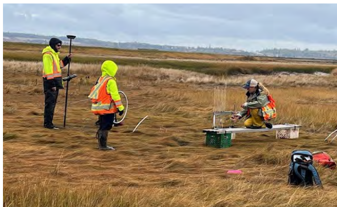
CBWES staff measuring the relative elevation change of wetland sediments using Rod Surface Elevation Tables (RSETs) at the Converse Salt Marsh, Sackville, NB - Oct 16th

If you have material to contribute for the next issue, please send it to: keely.croft@clra.ca