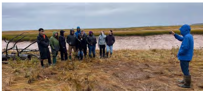
NBCC Students attending Field Tour - Oct 16, 2025