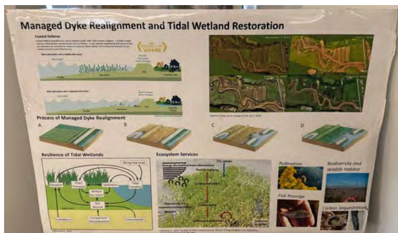
Managed Dyke Realignment and Tidal Wetland Restoration Poster