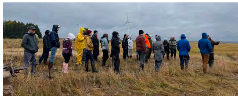
Converse Salt Marsh Field Tour - Oct 16, 2025