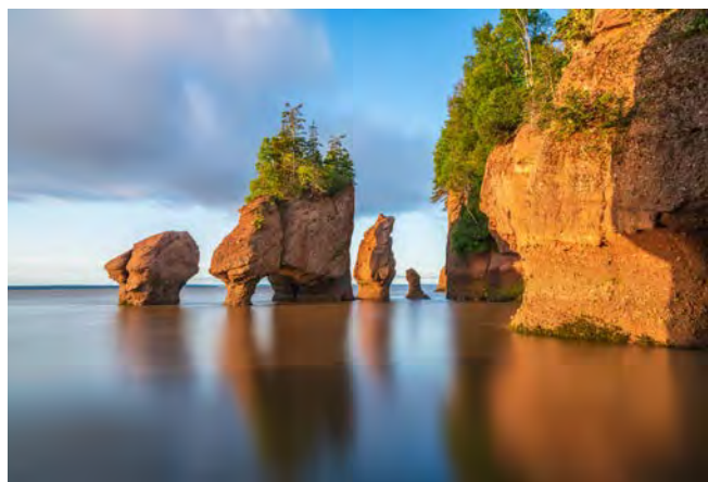
Hopewell Rocks Provincial Park, NB

More details will be shared as planning progresses—stay tuned!