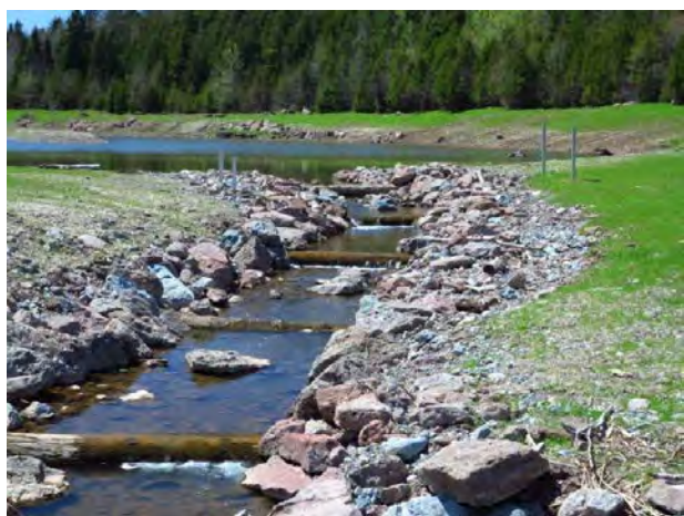
Matthews Cove Wetland Restoration, Quispamsis, NB