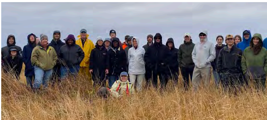
Atlantic Fall Reclamation Symposium - Chignecto Isthmus Field Tour, Sackville, NB - Oct 16, 2025

Retired Membership Available to retired persons: 1-time fee of $75.00