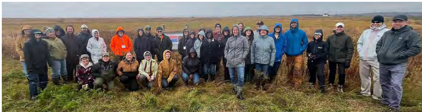
Atlantic Fall Reclamation Symposium - Converse Salt Marsh Field Tour - Sackville, NB - Oct 16, 2025