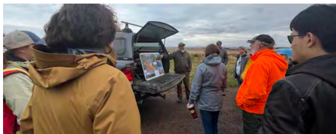
Fort Beausejour Field Tour - Oct 16, 2025