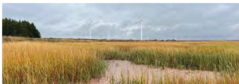
Converse Salt Marsh - Oct 16, 2025